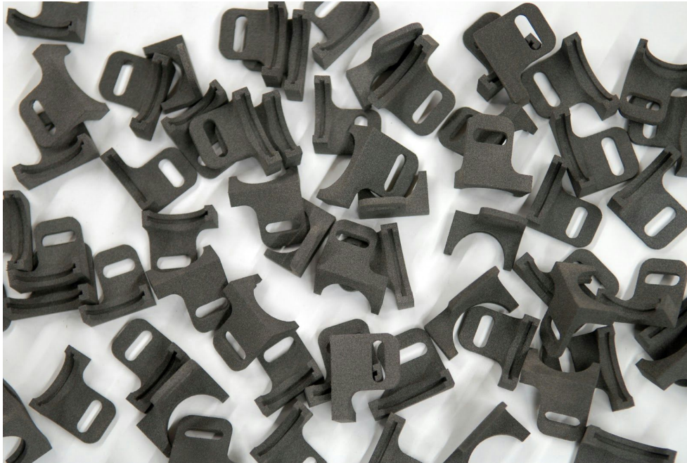
Sintratec Kit lense holders

Enter quality small batch production: In the manufacturing of new Sintratec Kits existing ones already participate by manufacturing lense holders for the Kits' optics.